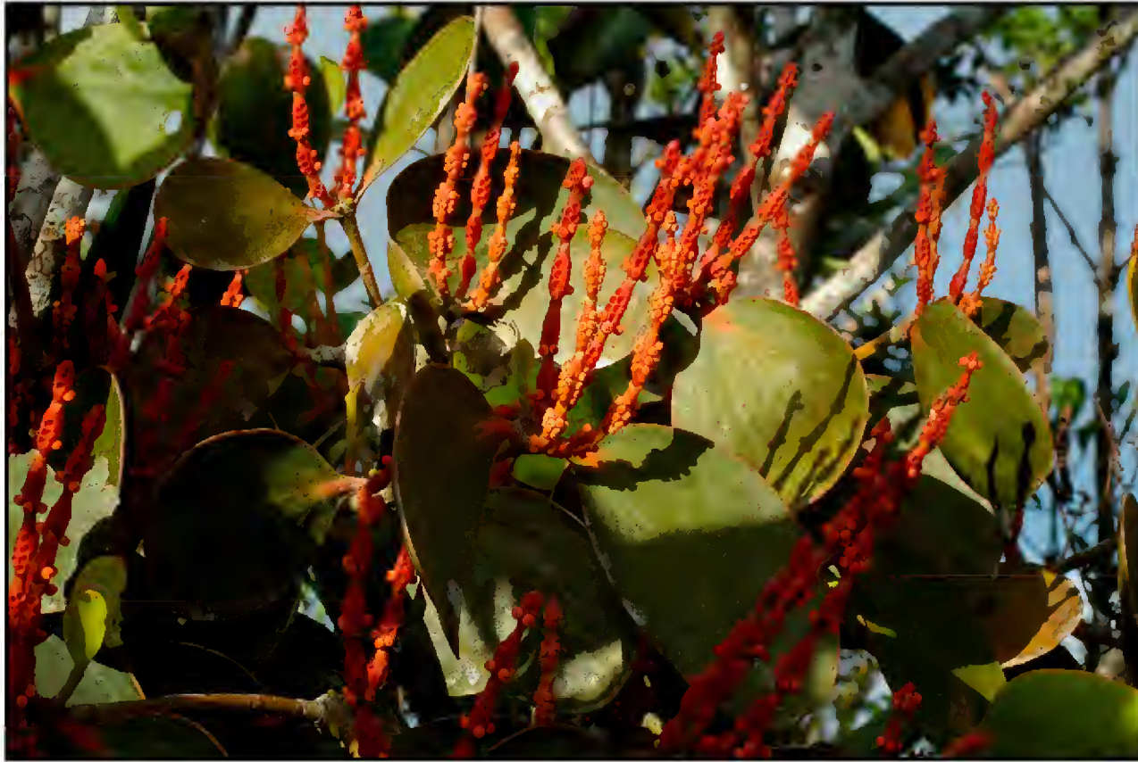
Fig. 1. General habit of the type of Dendrophthora fortis .